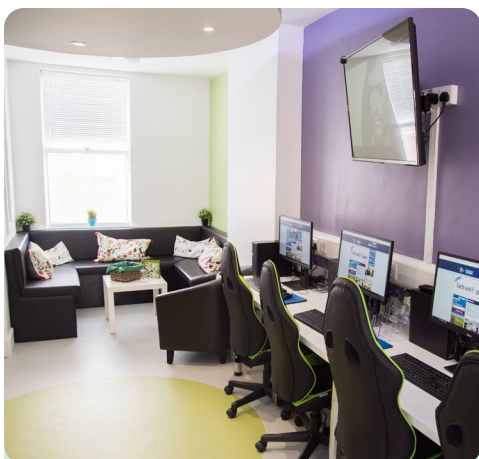
Our Information and Advice Centre and Youth Café service reopened in September.