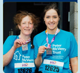
Vhi Women's Mini Marathon

We would like to thank you sincerely for your continued support for the work of Peter McVerry Trust. Your generosity ensures that we can continue to support people as they leave homelessness behind.