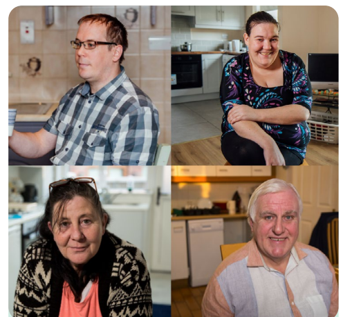
We worked with over 7,800 people in 2020.