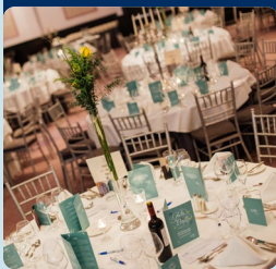
Gala Ball, Clontarf Castle Hotel