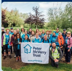
Long Walk Home, Boyne Valley Camino