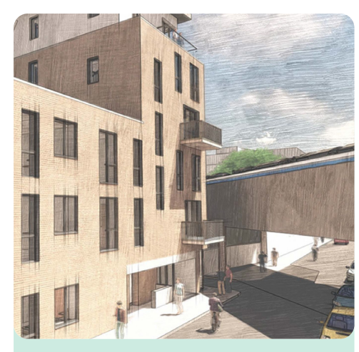
Construction of a new build apartment scheme of 12 apartments at Shaw Street, Dublin 2 began in March.