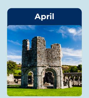
Boyne Valley Camino