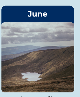
Lugnaquilla Mountain Trail